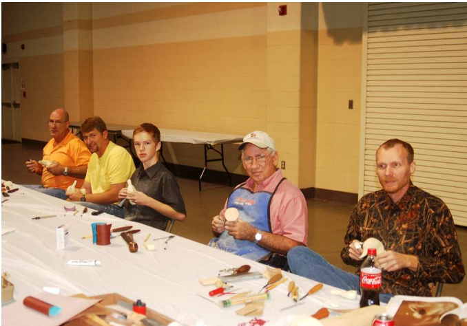
Some of our younger generation carvers join some of our more experienced carvers in the head whittling contest.