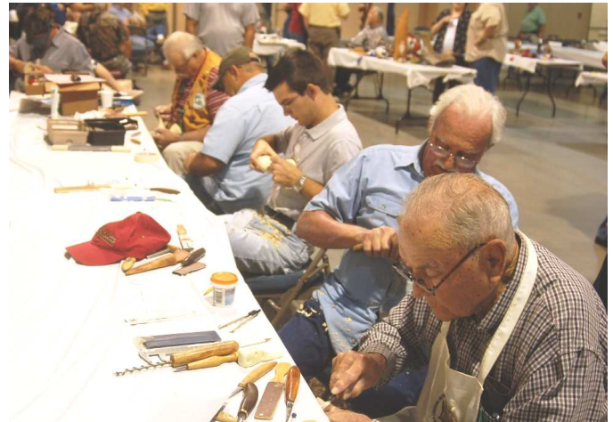
Carvers from all over the country demonstrate their skills as they took part in the head whittling contest.