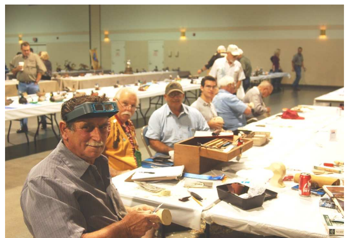
Participants start with a piece of wood and using only a knife carve out the head of the decoy and sand it to a smooth finish.